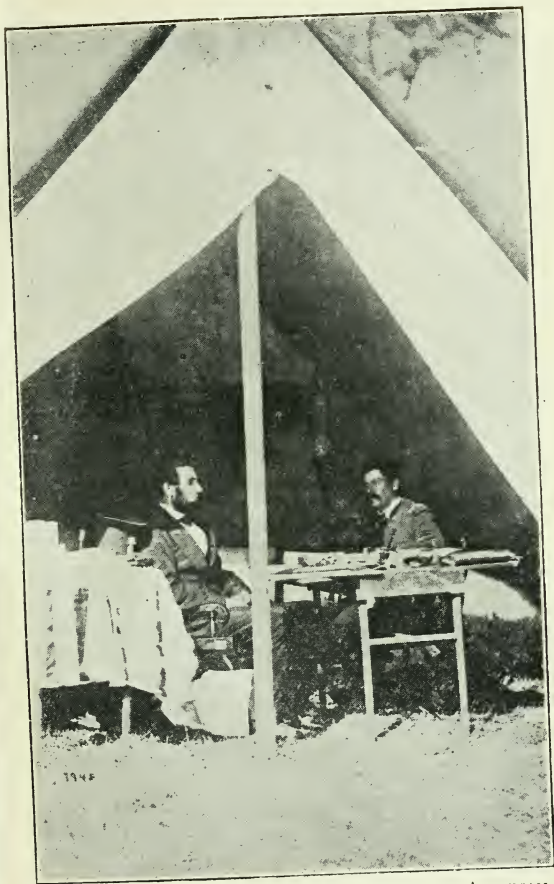
PRESIDENT LINCOLN AND GENERAL McCLELLAN AT ANTIETAM, OCTOBER 2, 1862, SOON AFTER THE BATTLE.